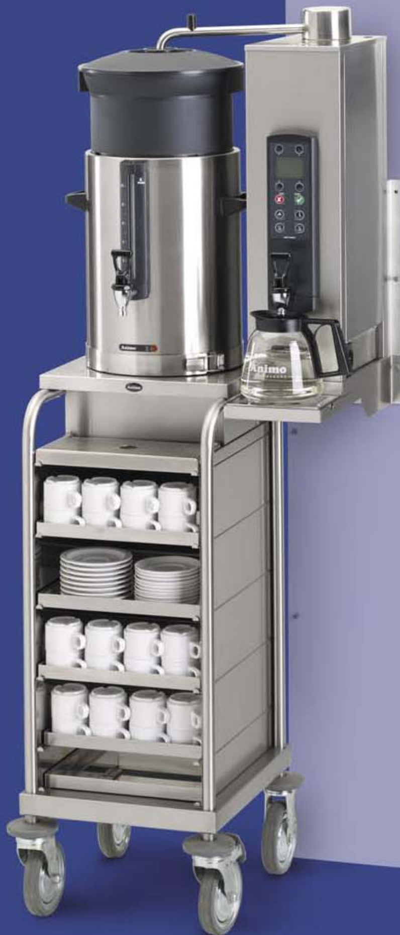
CB 10W mounted on the wall.

The Animo-line also offers the perfect means of serving coffee and tea in different places. An ideal set-up is the combination of a wall-mounted flow water heater with a container and a serving trolley. When the coffee or tea is ready, you can remove the filter and place the lid. The insulated lid makes the container safe to transport.