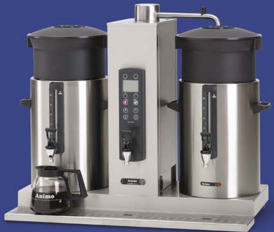
Model with two containers of 10 litre and a separate water boiler in the unit: CB 2x10W.