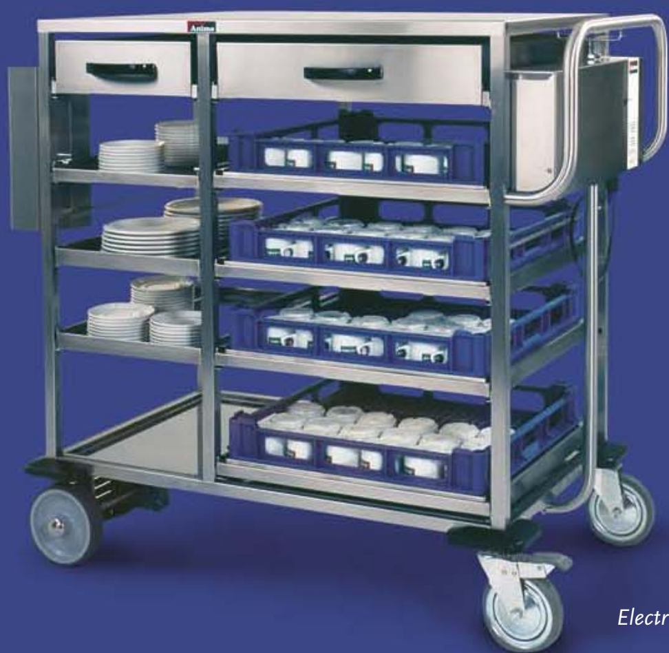
Electric serving trolley.

The combination of a ComBi-line machines and a Animo serving trolley is also ideal for the coffee and tea distribution in hospitals and residential homes. Animo offers a wide range of trolleys. Varying from a simple trolley for one coffee container to a very highly specified electrically-powered trolley for two coffee containers. We would be pleased to inform you about the possibilities.