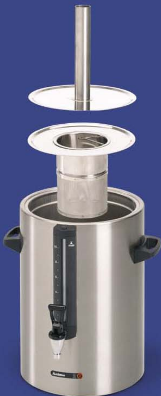
For brewing tea in a container, you can make use of the special tea filter and filling pipe.