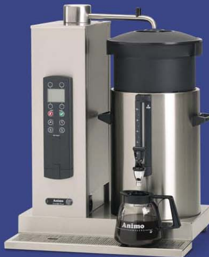
ComBi-line with 10 litre container positioned on the right: CB 1x10 R.