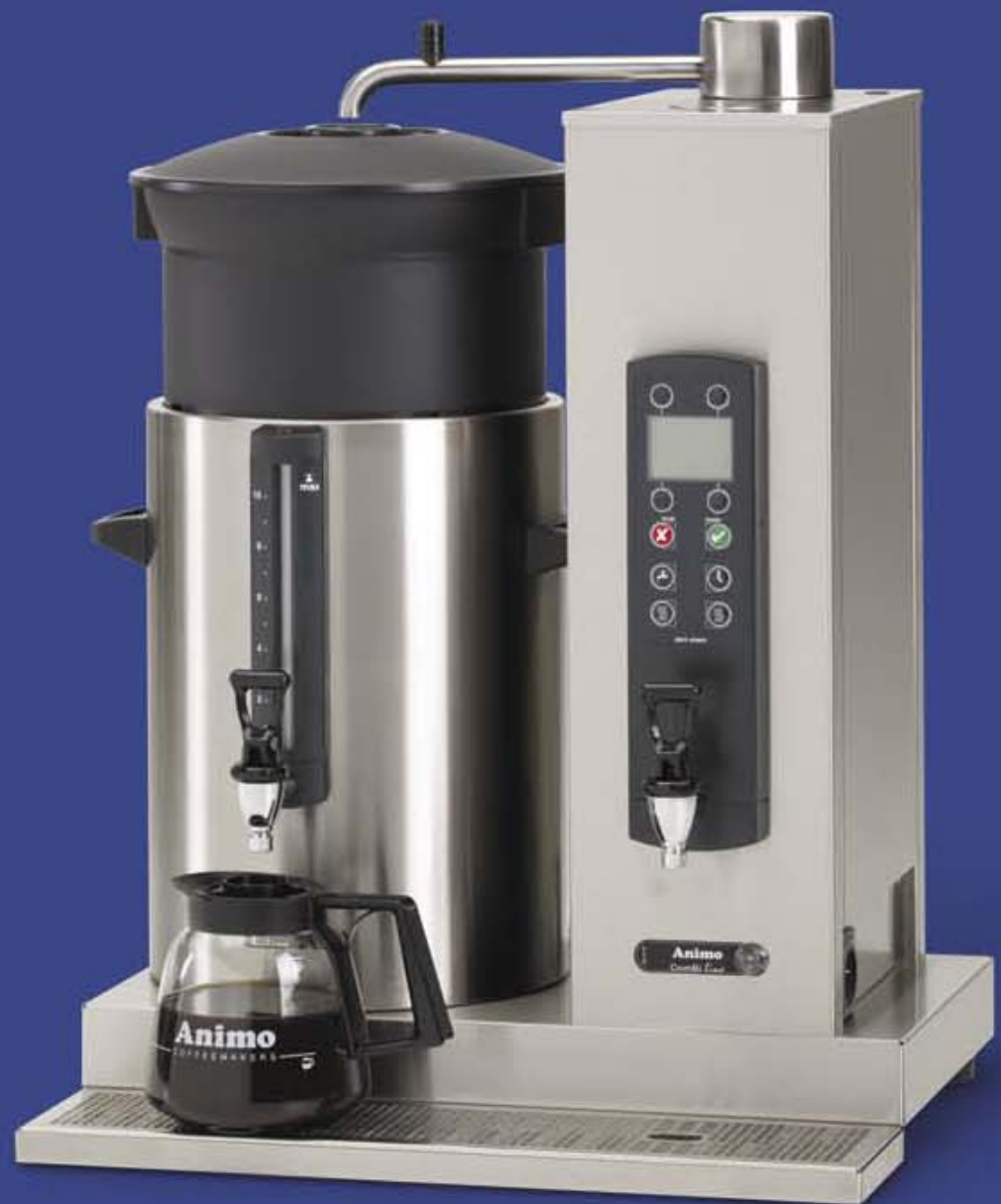
ComBi-line with a 10 litre container positioned on the left and a separate water boiler in the unit: CB 1x10W L.

In addition to this user menu, the control panel also provides access to the operator and service menus. These menus can only be accessed with a PIN code. They include the settings for controlling the coffee brewing process, the separate boiler and for service and maintenance.